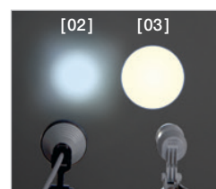
Comparison of homogeneity